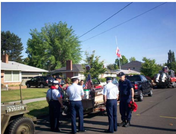
Making ready for the 4 th of July Parade